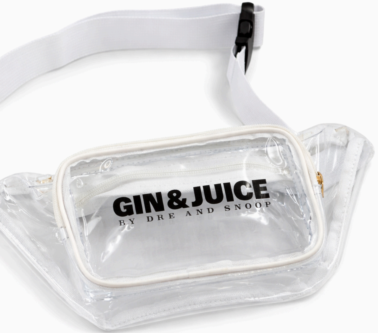
P951 CUSTOM FANNY PACK

Sleek, functional waist packs designed for movement and convenience. Built with clear, solid, or mixed materials and finished with custom prints, trims, and branded details your way.