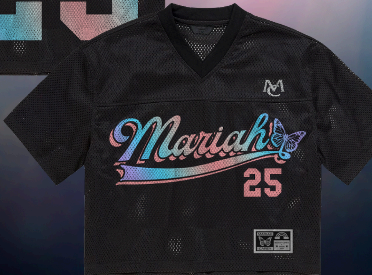
P832 CROPPED FOOTBALL JERSEY

Classic football jerseys, flipped with a cropped fit for a more styled, statement look. Breathable mesh, bold graphics, and endless ways to make it feel like your own.