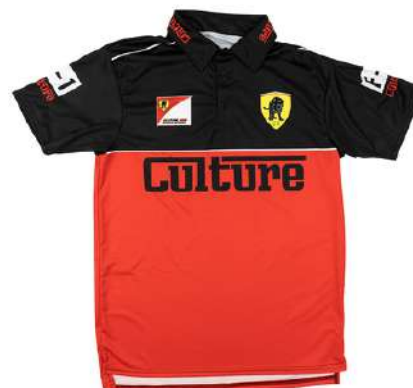
S358 SUBLIMATED POLO