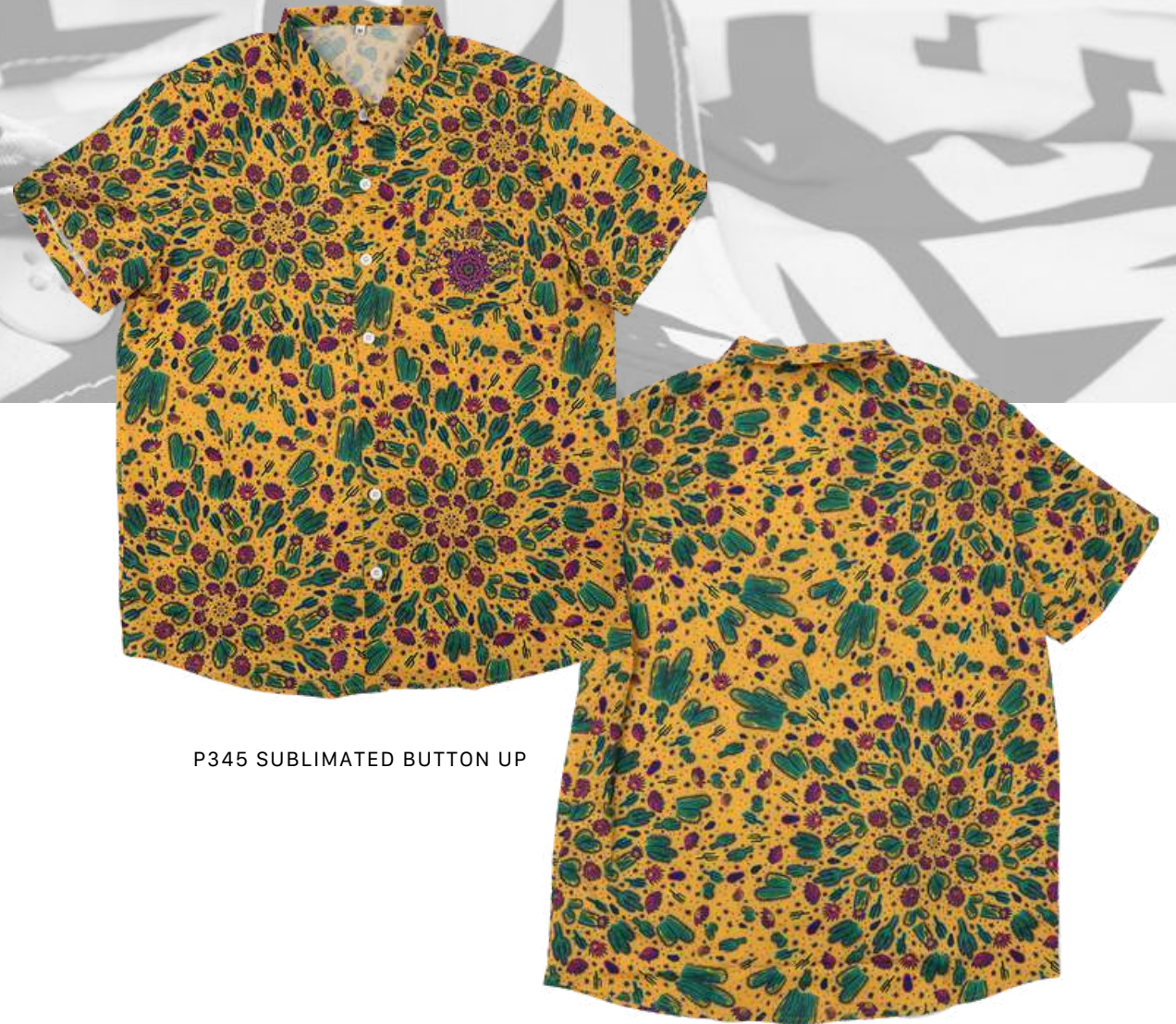
P345 SUBLIMATED BUTTON UP