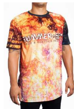
S131 SUBLIMATED JERSEY