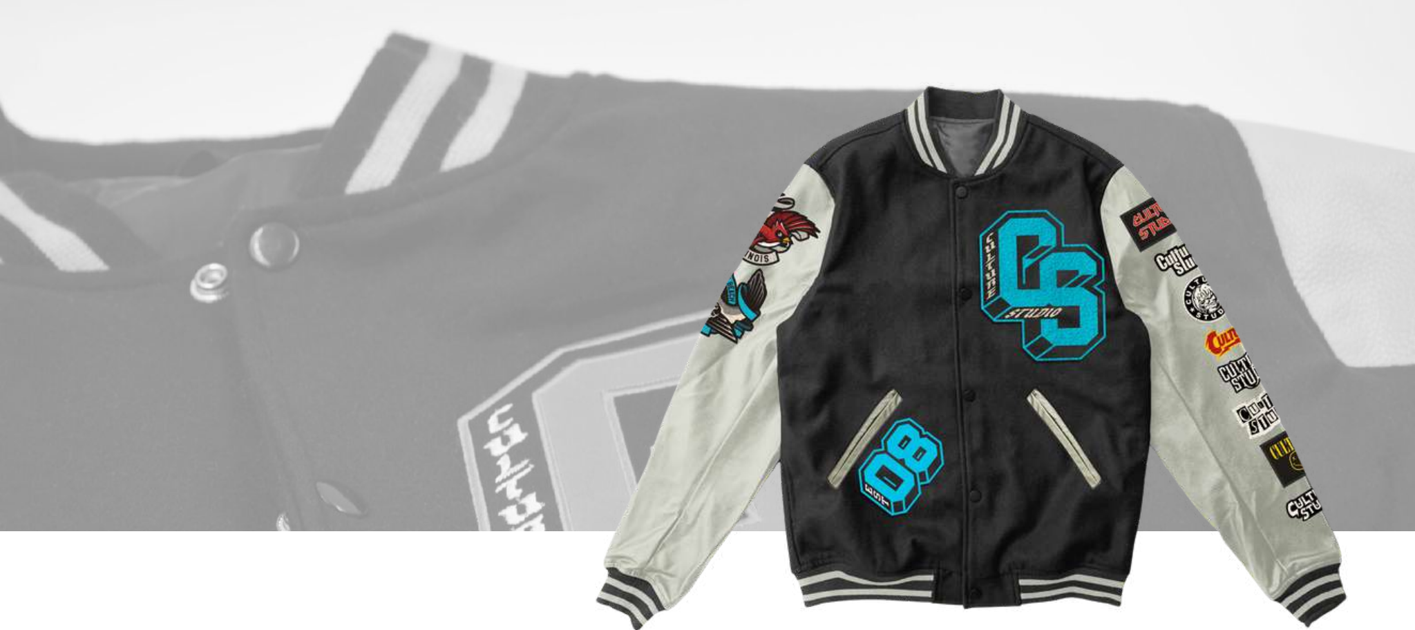
P397 VARSITY JACKET