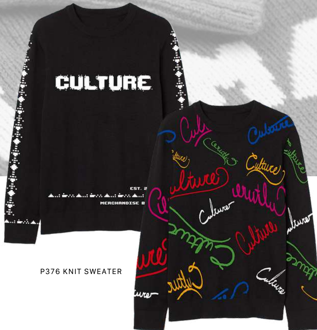
P376 KNIT SWEATER

Create your own all-over knit pattern with your brand's logo or full color artwork.