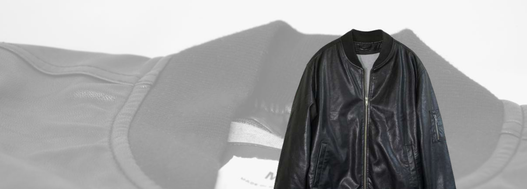
395J VEGAN LEATHER JACKET