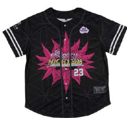
P479 SUBLIMATED BASEBALL JERSEY

Decorate your own jersey seam-to-seam with sublimation options.