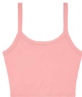
1012 MICRO RIB SPAGHETTI TANK

Add a bold screen print or embroidered logo for a fun addition to your product line.