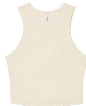
1019 MICRO RIB RACER TANK