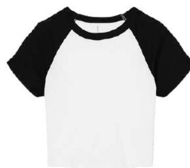
1201 MICRO RIB RAGLAN