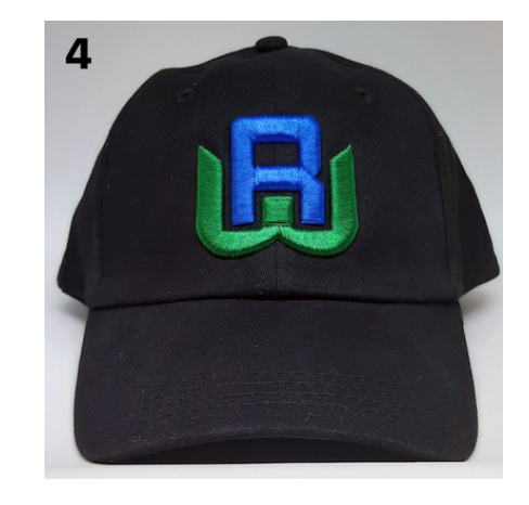
4. Final product.