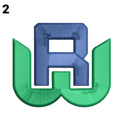
2. The artwork or logo is digitized.