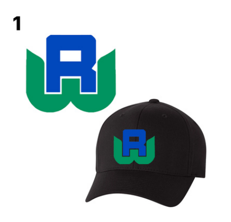
1. You provide your logo or artwork.

All artwork or logos must be "digitized", which is the specialized process of converting two dimensional artwork into stitches or thread required for all embroidery.