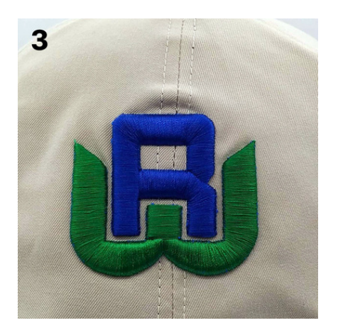
3. Once the order is placed we provide a complimentary high res image of a physical sew out.